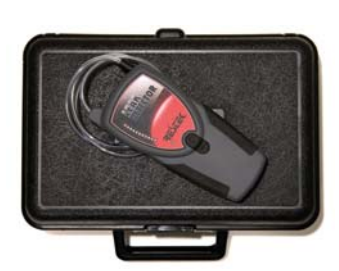
Carrying/storage case included with purchase of unit.

Avoid using liquid leak detectors on a capillary system! Liquids can be drawn into the system.